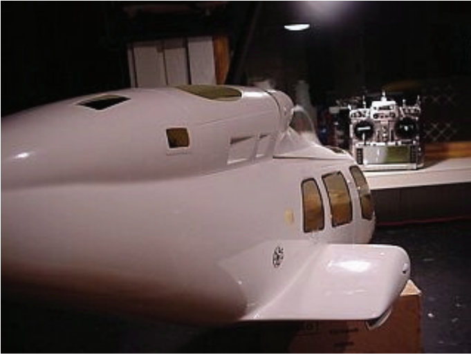
Just a cool angle....