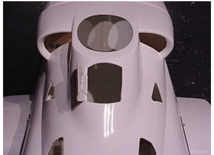
Hinge added , hole will be filled . This allows plenty of room for starting . Side screens and dome opening supply cooling air .