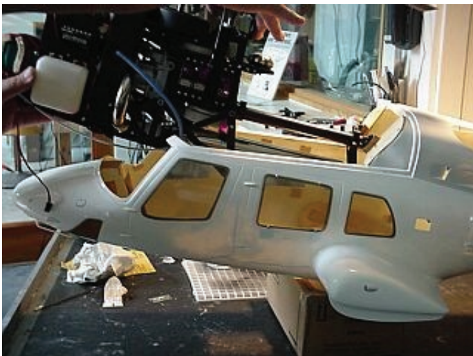
They just slide right in!