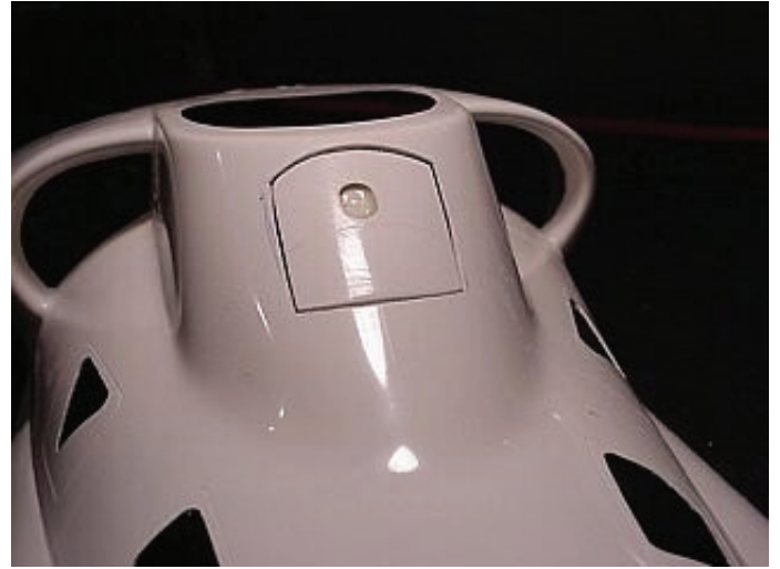
Here is the door ready for low profile hinge.